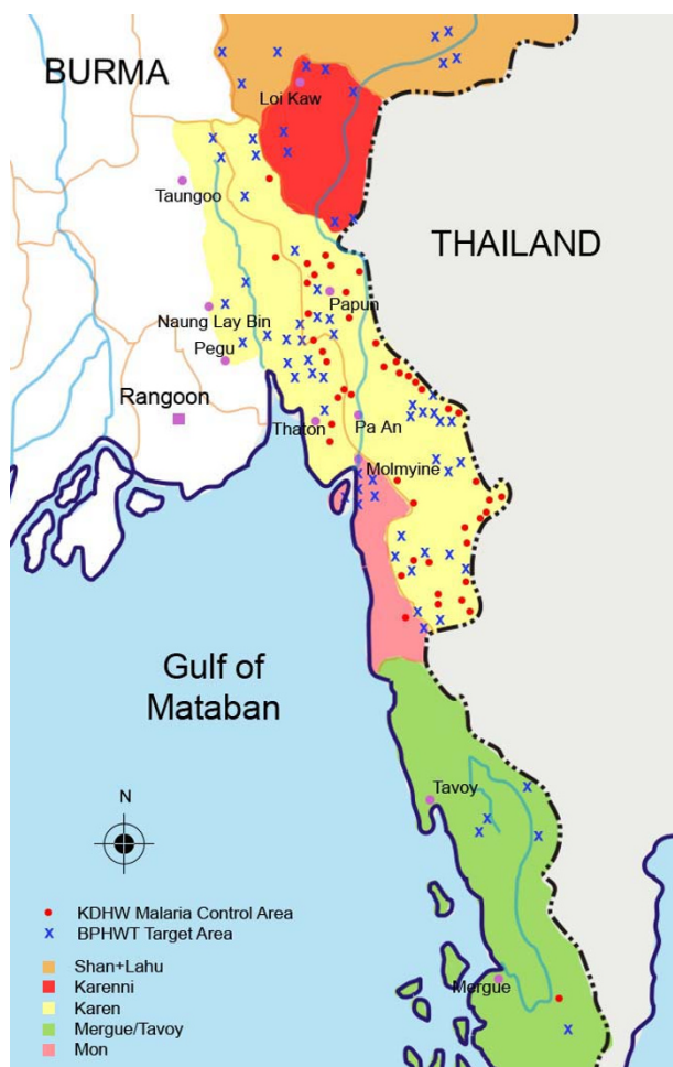
Figure 1 Target area of the KDHW and BPHWT. BPHWT: Backpack Health Worker Team; KDHW: Karen Department of Health & Welfare.

population is a subset of the entire KDHW population of 95,000. The pilot program included distribution of long-lasting insecticide treated nets (LLITNs), malaria education messages, and early detection with the Paracheck-Pf® device and therapy with mefloquine-artesunate for three days (MAS3). Baseline screenings were conducted prior to initiation of malaria control activities, permitting the estimation of malaria prevalence among new villages in each year.