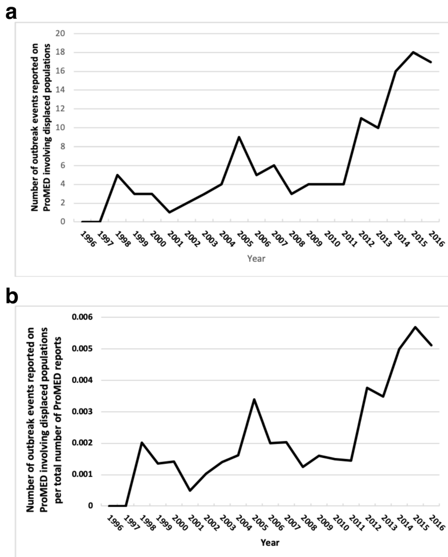
Fig. 2 a Number of outbreak events involving displaced populations reported on ProMED from 1996 to 2016. b Number of ProMED outbreak events involving displaced populations per total number of ProMED reports from 1996 to 2016

Table 1 demonstrates all reported pathogens, count of outbreaks, and approximate suspected and confirmed case counts by WHO region. Supplementary Tables 1 and 2 provide additional details on outbreak location and approximate case counts. When a pathogen was not