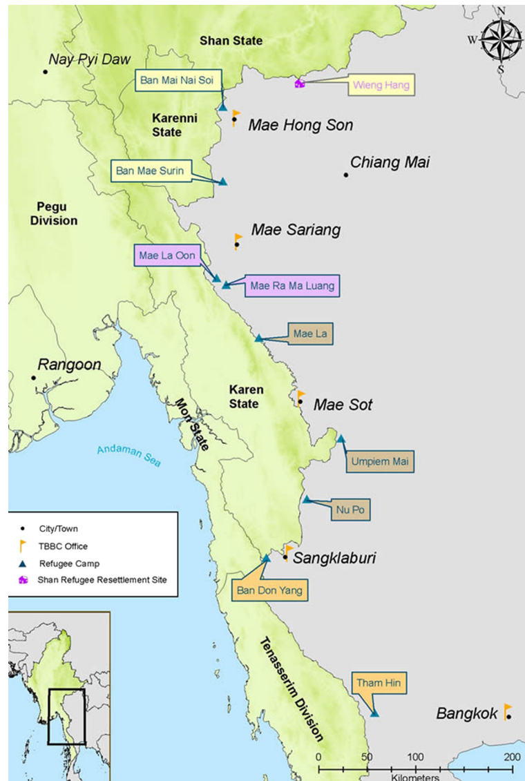
Figure 1 Refugee Camps along the Thailand-Myanmar Border.

and time to the nearest Thai Hospital varies between camps (30 mins to 8 hours) and according to the condition of roads, which deteriorate during the rainy season. Health care in Mae La is provided by Non-Governmental Organisations (NGOs) – initially by Médecins Sans Frontières (until 2005) and subsequently by Aide Médicale Internationale (AMI). The refugee situation in Mae La Camp is stable and the majority of morbidity is associated with infectious and chronic diseases; while war trauma and reproductive health problems exist, these are comparatively minor. One of the principle health issues is multi-drug resistant Plasmodium falciparum malaria – however significant improvements in this area have been made due