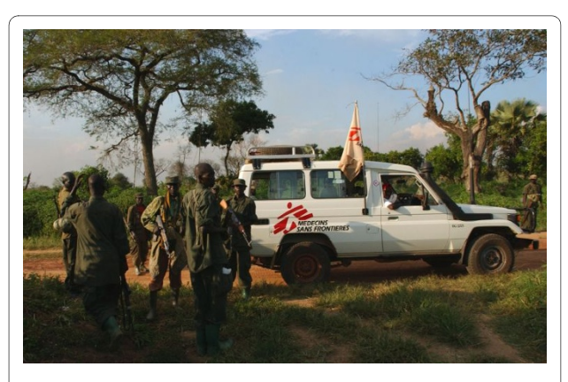
Figure 3 An MSF car in conflict-affected northern Uganda.

HIV prevalence data for 2005. Most countries were in Central and West Africa where prevalence is low to medium (1-10%) compared with higher rates in more stable southern Africa (10-50%) [18]. However, these rates usually reflect the situation in urban and stable areas where testing has been performed. In many of the areas where our HIV programmes were introduced there had been no prior HIV testing. ART coverage rates varied from 1% in Sudan to 51% in Uganda [see Additional file 1, Table S1] [19], but considerable in-country variation exists with rates as low as 2-122 per 1000 of eligible individuals receiving ART in conflict-affected regions of northern Uganda [4].